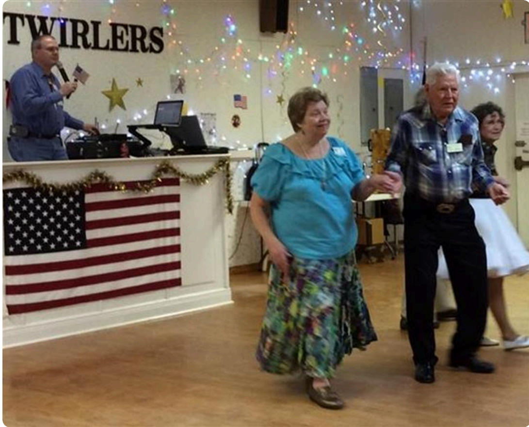
Always a loving, happy fun dancer!